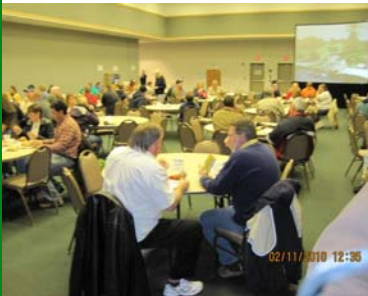
Participants discuss new techniques at the recent Water Garden Expo