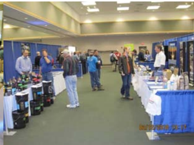
Many new products were highlighted at the vendors trade show