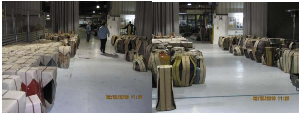
The new pottery shipment arrived last week!