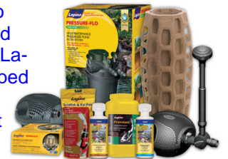
Laguna has a full line of new products now available